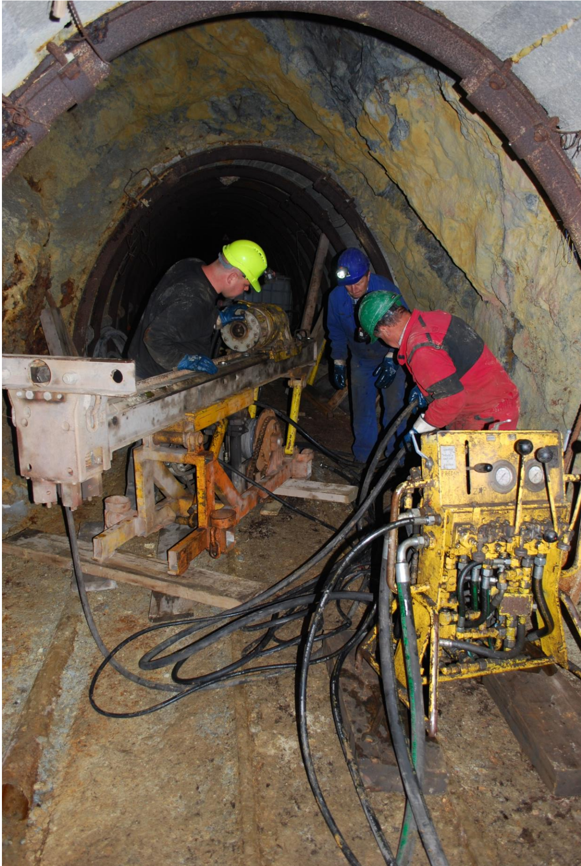
Image 4: Drill rig and ancillary equipment being set up at the drill site within the underground Andrej adit

Note: This announcement is authorised by the executive board on behalf of the Company.