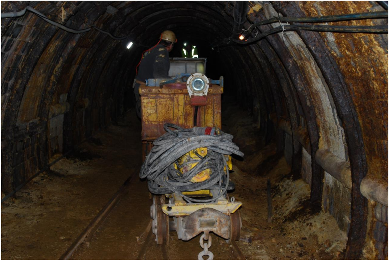
Image 2: Drill rig and ancillary equipment being mobilised to the underground Andrej adit