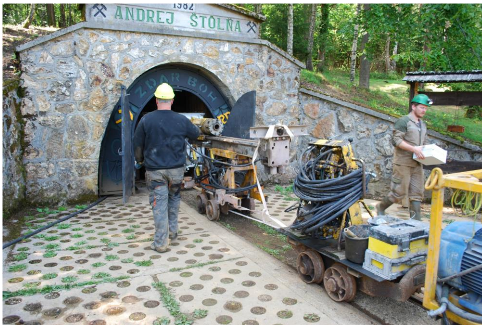
Image 1: Drill rig and ancillary equipment at the entry to the underground Andrej adit

The following images show the drill rig being mobilised to site at Sturec and being set up at the drill site in the underground Andrej adit: