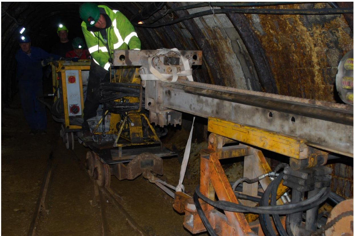
Image 3: Drill rig and ancillary equipment being mobilised to the underground Andrej adit

Note: This announcement is authorised by the executive board on behalf of the Company.